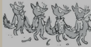
The Small Foxes