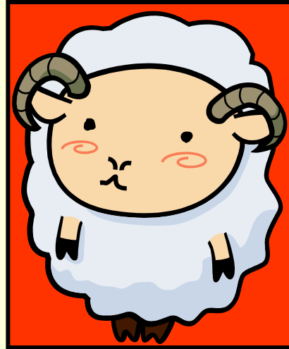
One of Peep's Prize Sheep

The picture is used to reinforce the realism of the event and should have a caption giving details about the picture.