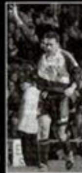
CALEY UP.

ELEVEN days ago the gutting on the Lisbon Lions Stand collapsed — last night it was John Barnes' badly-built TEAM that came crashing down around his ears.